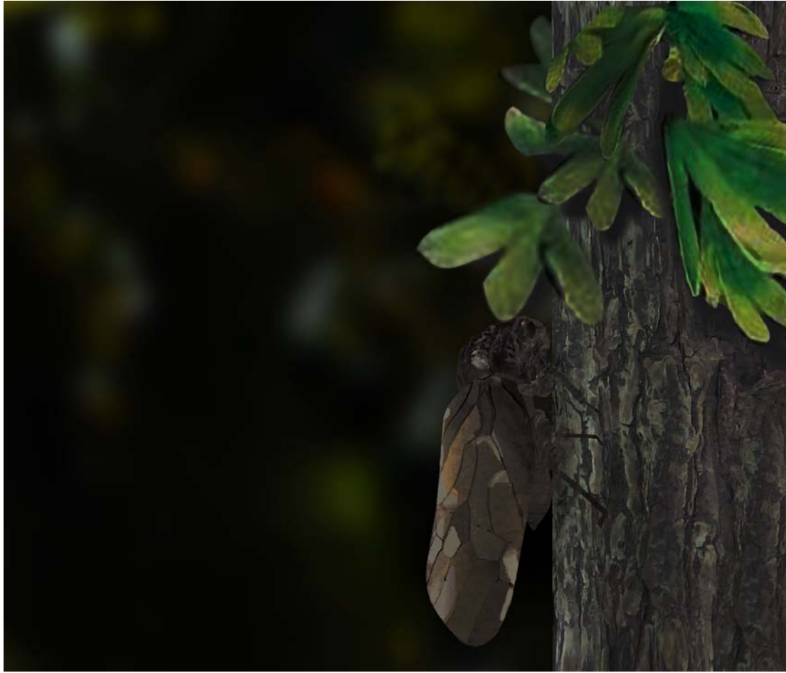
Fig. S2. Ecological restoration of Sanmai kongi sp. nov. from the Middle–Late Jurassic epoch of Daohugou, China.