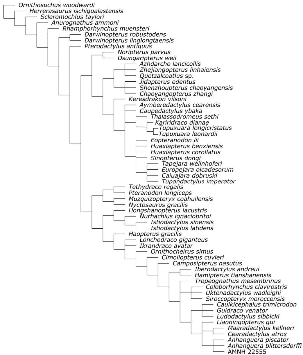
Fig. 2. Strict consensus of the 15 most parsimonious trees of the analysis including Keresdrakon vilsoni and Kariridraco diana in the modified dataset of Holgado et al. (2019)