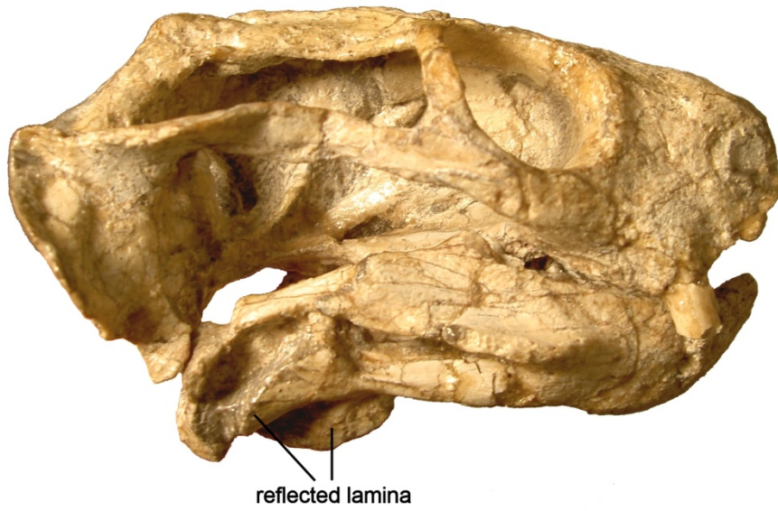
Figure S1. Skull of Pristerodon mackayi (SAM-PK-K1658) in lateral view showing the ventral extent of the reflected lamina.