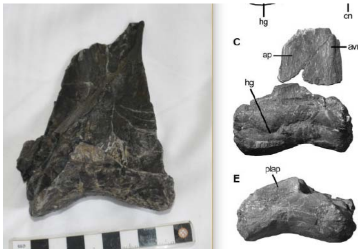
Fig. S2. Right astragalus of Fukuiraptor and left astragalus of NMV P150070 in posterior view showing accessory posterolateral ascending process (plap – arrow).

We note that the autapomorphy of Tachiraptor “the caudolateral corner of the fibular condyle forms a sharp angle in proximal view and extends slightly more caudally than the medial condyle” in Langer et al. (2014) is also present in a small abelisauroid from Tanzania (MB.R.1751; Rauhut 2005; pers. obs.).