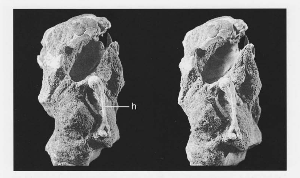
Fig. 1. Kryptobaatar sp., GI 5/302, Late Cretaceous, ?Djadokhta Formation, Northern Ukhaa Tolgod, Nemegt Basin, Gobi Desert, Mongolia. Skull associated with both dentaries (right lateral view) and complete right humerus (h). Stereo-photograph \times 2 .

preservation is characteristic for the humerus GI 5/302 (Fig. 2), in which the medullary cavity has been apparently replaced by calcite. The shaft of the humerus on its ventral side is devoid of the compact layer, which has been preserved only on the medial side (right side of the photographs in Fig. 2), and on the unexposed dorsal side. The compact bone is completely preserved on the distal epiphysis and the margin along which it has been broken off is well seen. On the proximal epiphysis the compact layer has been partly preserved, being seen as white, irregularly distributed patches. Because of this state of preservation the shaft of the humerus appears unusually thin, especially in relation to the distal epiphysis, on which the compact bone has been completely preserved. In spite of the lack of the compact bone on the shaft, details of its structure (such as a wide intertubercular groove) are preserved, but this groove is less deep than in bones with the compact layer preserved.