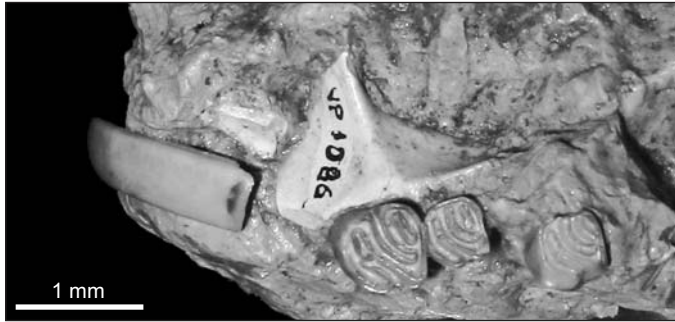
Fig. 1. IPS 31102, a left maxillary fragment with the upper incisor and P4–M2 of the castorid Chalicomys catalaunicus (Bataller, 1838) from Sant Quirze (MN7+8 from the Vallès-Penedès Basin, Catalonia, Spain). Note the abundant cement infilling all synclines.

comys but shows a markedly reduced M3. Huguency (1999) noted that some molars of Schreuderia adroveri and Chalicomys catalaunicus show a tendency to display an S-pattern, leading her to place them into the same subgenus, which she considered to be related to castoroidines. This was later disputed by Korth (2001), who considered Schreuderia to be a castorine, probably even a subgenus of Chalicomys . Certainly, a few molars of C. catalaunicus display a tendency towards an S-pattern at particular wear stages, but generally the occlusal pattern is castorine-like. Moreover, the cheek teeth are hypsodont and the striae/iids are longer than in Steneofiber depereti , further displaying abundant cement in all the synclines/iids (Fig. 1; see also Crusafont Pairó et al. 1948: pls. 5–8). These features strongly support the inclusion of this taxon in Chalicomys as a distinct and rather small-sized species, which partially overlaps with S. depereti but tends to be somewhat larger (Fig. 2). A revision of the type species is clearly needed in order to assess the validity of the (sub)genus Schreuderia .