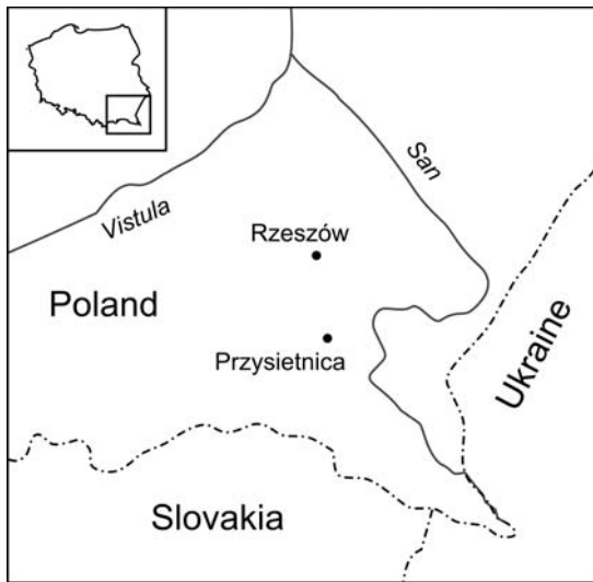
Fig. 1. Location of the village of Przysietnica in southeastern Poland, where the specimen ZPALWr. A/4004 was found.

dicating the IPM4A Zone (Kotlarczyk et al. 2006: fig. 6). The fossiliferous horizon of Przysietnica (PS-5) has been dated to Rupelian, early Oligocene, circa 29 Mya, on the basis of the fish assemblage indicating the IPM4A Zone, and correlated with the calcareous nannoplankton of the NP24 Zone sensu Berggren et al. (1995). The fossil-bearing section at Przysietnica is currently referred to the Šitbořice Member of the Subsilesian Unit of the Menilite Formation of the Polish Outer Carpathians (Kotlarczyk et al. 2006: 16, 96).