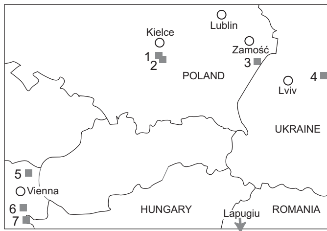
Fig. 3. Geographical distribution of Lingula dregeri in the Miocene: 1, Korytnica Basin (Poland): Korytnica, Chomentów (Friedberg 1930; Barczyk and Popiel-Barczyk 1977; Gutowski 1984; Radwańska and Radwański 1984; and present data); 2, Wójcza-Pińczów Range (Poland) (Popiel-Barczyk and Barczyk 1990; and present data); 3, Lublin Upland (Poland): Huta Lubycka, Monastyrz, Długi Goraj (Popiel-Barczyk 1977, 1980; Jakubowski and Musiał 1977; present data); 4, Podolia (Ukraine): Obertasów near Złoczów (Friedberg 1921); 5–7, Vienna Basin (Austria): 5, Austränk (Dreger 1889); 6, Loretto (Dreger 1889); 7, St. Margarethen (Meznerics 1943; Schmid et al. 2001). A Lingula has been recorded in Lapugiu (Romania) by Bărbulescu and Rado (1984) in the Badenian (Miocene). The following localities are not indicated on the map: Cagliari, and vicinities: Sant Elias, Mirrionis island, San Michele hill, in Sardinia (Italy) (Dreger 1911).

The lingulide specimens from Podolia (Ukraine; Fig. 3) identified by Friedberg (1921) as Lingula aff. dumortieri have been attributed to Lingula dregeri Andreae, by Popiel-Barczyk and Barczyk (1990) based on size. Friedberg (1921) stated that the specimens he referred to L. dumortieri are similar in outline and ornamentation to L. dregeri .