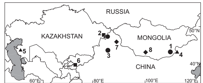
◆ late Paleocene ■ early Eocene ▲ middle Eocene ● late Eocene

Material. —MPC-MX 1/108, an isolated tooth. This specimen was collected by one of the co-authors, TC, during the paleontological expedition on 4 th September, 2008 (Tsubamoto et al. 2010) from Ergilin Dzo (= Ardyn Obo) located in the southern part of Dornogobi Aimag (eastern Gobi Desert), southeastern Mongolia (43°19'40"N, 109°07'42"E, map datum: WGS84; Yanovskaya et al. 1977; Dashzeveg 1993; Tsubamoto and Tsogtbaatar 2008; Fig. 1: 1) in Ergilin Dzo Formation (= Ardyn Obo Formation by Berkey and Granger 1923; Ergilin Dzo svita/suite by Yanovskaya et al. 1977 and Dashzeveg 1993); late Eocene (Ducrocq 1993; Meng and McKenna 1998; Tsubamoto et al. 2004, 2008).